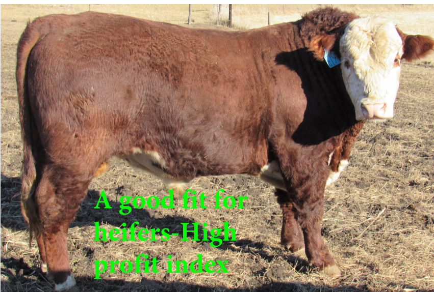
EPD Percentiles for PITT ASSURANCE YORK II 1507 ET (DLF,HYF,IEF) (P43826022) EPDS AS OF 01/07/19