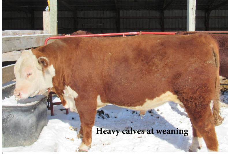
Heavy calves at weaning