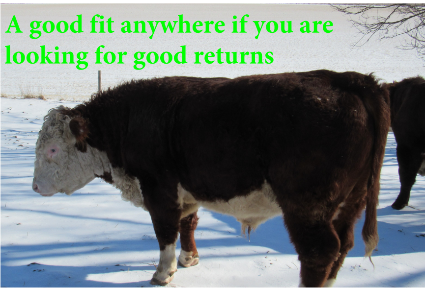
EPD Percentiles for PITT RESOLUTE RED BULL III C24 (P43825999) EPDS AS OF 01/07/19