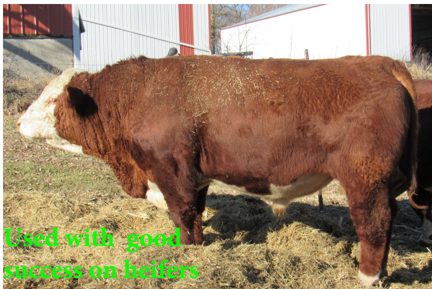
EPD Percentiles for PITT B007 BUILT TUFF D019 (DLF,HYF,IEF) (P43733229) EPDS AS OF 01/07/19